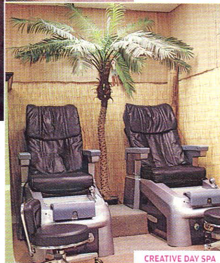
CREATIVE DAY SPA