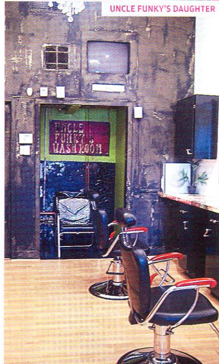
UNCLE FUNKY'S DAUGHTER