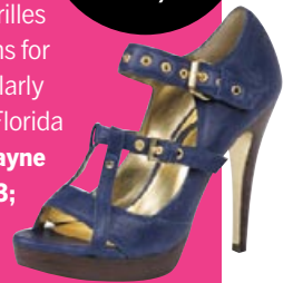
CHARLES BY CHARLES DAVID "GAZELLE" PUMPS REGULAR PRICE $155 LOCAL BREAKS PRICE $124