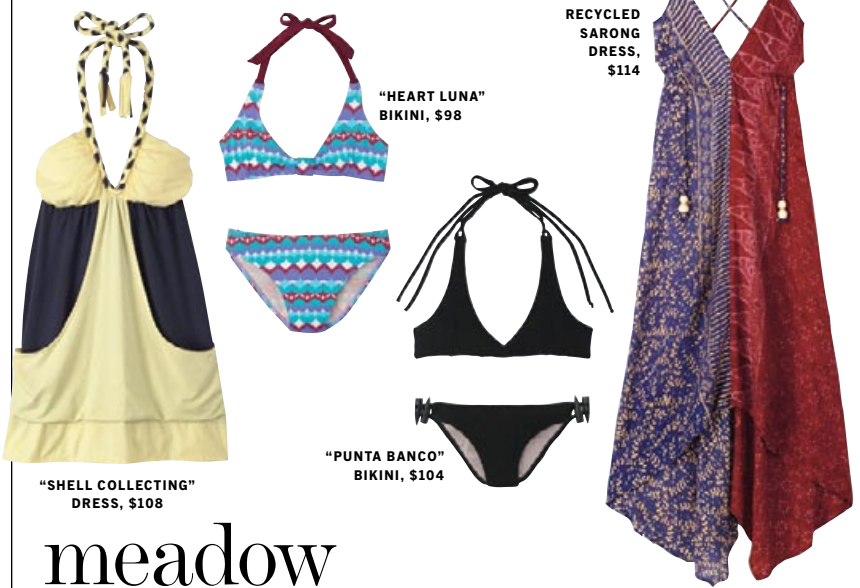
"SHELL COLLECTING" DRESS, $108